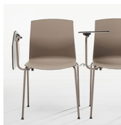
Writing pad / KB Easily removable HPL (high-pressure laminated) writing pad.