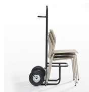
Stacking trolley / KB